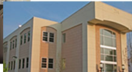
Medical Arts' state-of-the-art facility in Huntington, L.I.

When Medical Arts Radiology went to replace their older, thick-client PACS system, they chose to go with INFINITT's latest generation, web-based PACS. The radiologists liked the 64-bit, web-based architecture, the viewer functionality and the company's ability to do a quick install.